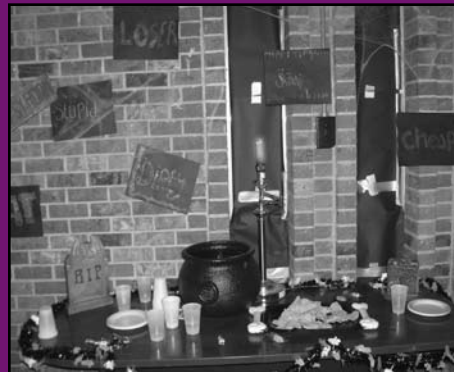
Hateful words highlight a table depicting verbal and emotional abuse.