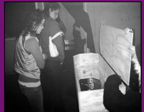
Viewers see the ultimate horror of relationship violence, a coffin.