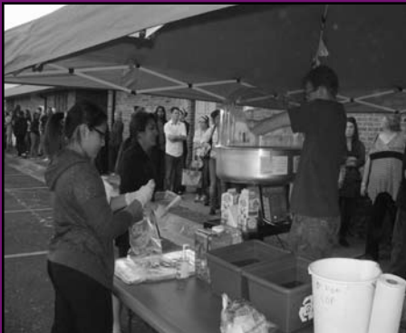
Volunteers work diligently making cotton candy treats for the crowd.