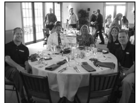
Our sponsors from DFW Alarm and Point Bank pause for a quick shot before the luncheon.